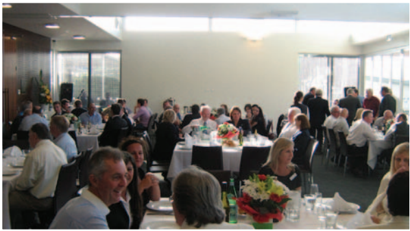
Guests enjoying the evening seated at their tables in the ESMP Condolence Rooms

On Wednesday the 8th December ESMP held our annual "Supplier's Function". This event was very well attended with over 70 people present. It is an opportunity for us to express our gratitude for the dedication and professionalism of our network of suppliers and referrers.