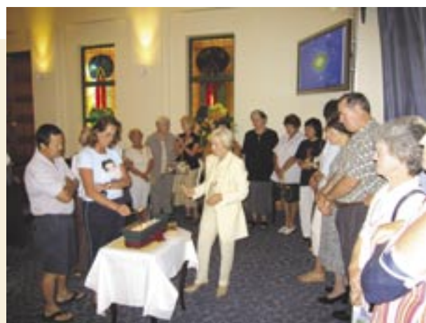
Photo features December candle ceremony

Programs in 2005 will be on Saturday 5th March, 7th May